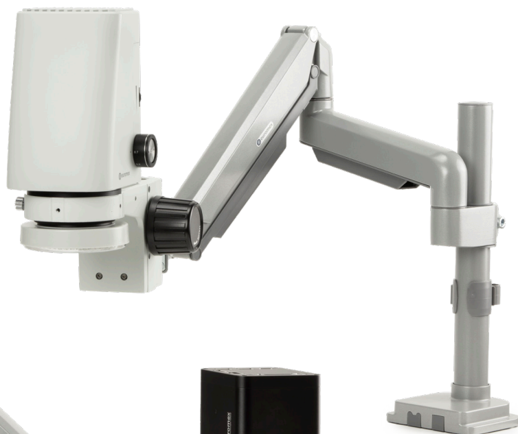
● NZ.9047 with MZ.4600 head