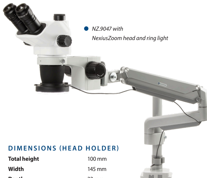
● NZ.9047 with NexiusZoom head and ring light