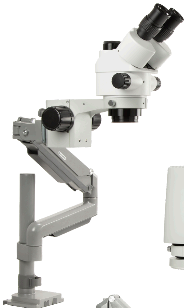
● NZ.9047 with StereoBlue zoom head