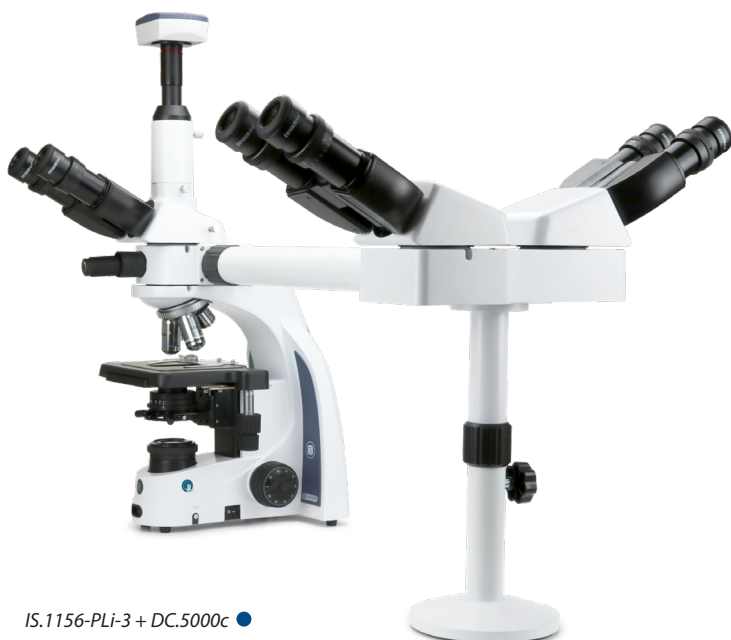
IS.1156-PLi-3 + DC.5000c ●