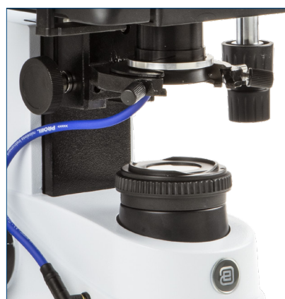
● Cardioid darkfield condenser with 3 W LED and integrated power supply