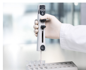
Dispensing small volumes