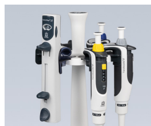
The rack mount also fits the Transferpette® S bench-top rack.