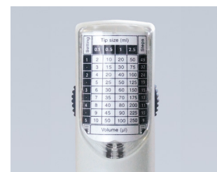
Fast volume selection with the volume table on the back side