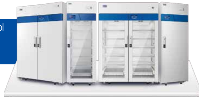
HYC-1099TF HYC-509T HYC-1099T HYC-509TF

Liquid crystal touch screen control Intelligent IoT