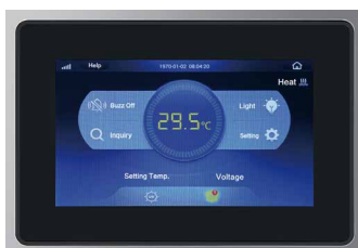
7 Inch LCD Screen