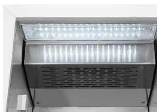
UV Sterilization Lamp