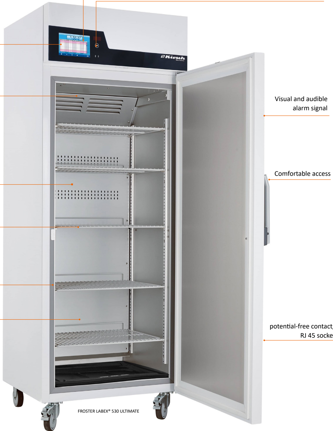
FROSTER LABEX® 530 ULTIMATE