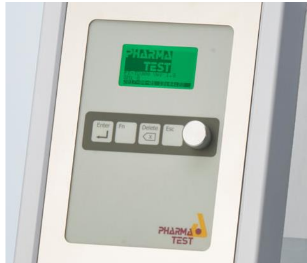
Navigate the menus using a click wheel

A USB flash drive can be connected to the instrument to save and load methods in .csv-format. Print-outs can be stored as text files. Furthermore instrument firmware updates can be installed and factory settings be restored by using the flash drive without the need for any PC or programming tool.